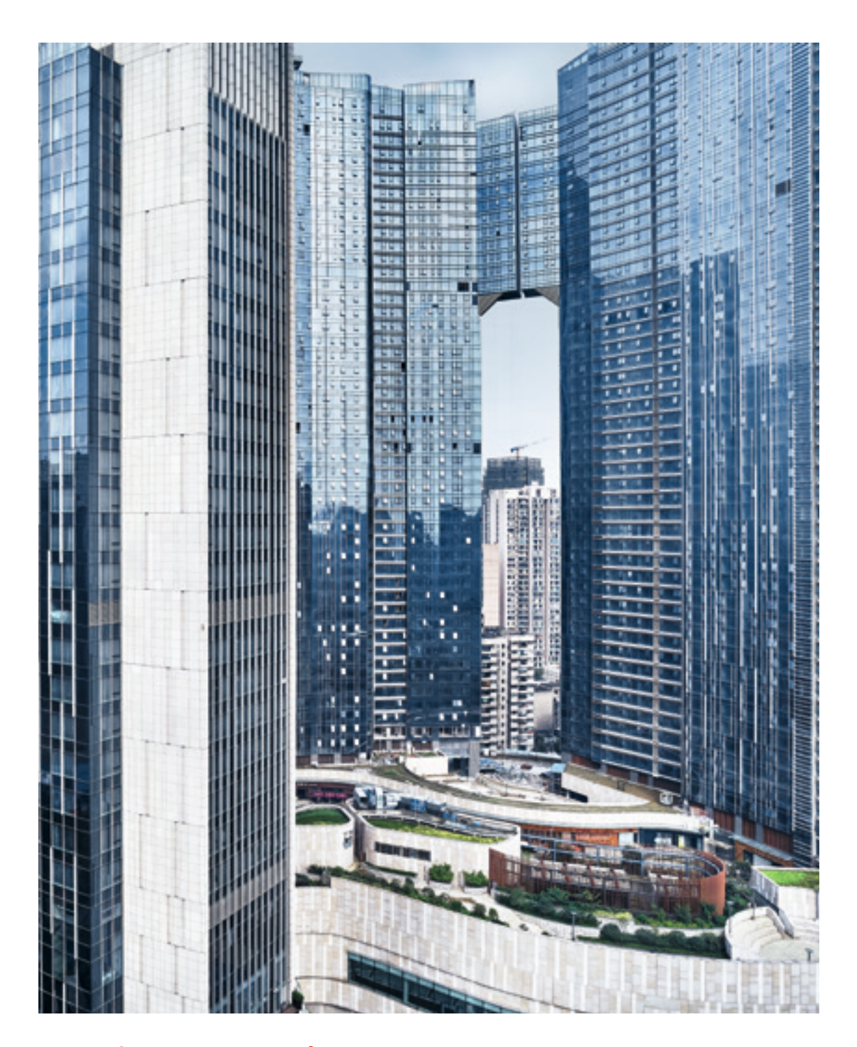
High-rise solutions. Better buildings for tomorrow.